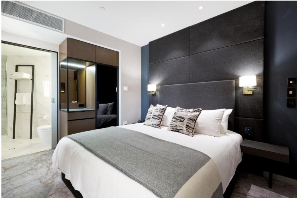
King Standard Room (prices available from $325)